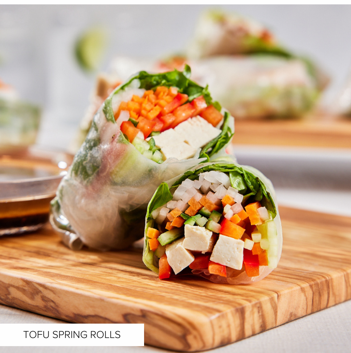
TOFU SPRING ROLLS